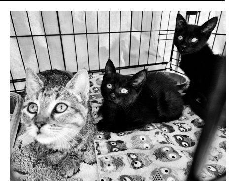
"I could teach you a thing or two about gardens," says Bones, the nursery cat.

the holiday season. For more information please contact LOVN or Feline Network.