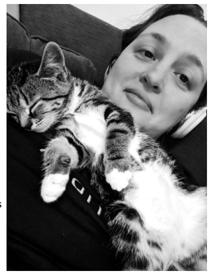
"Seems safe, I think I'll nap."