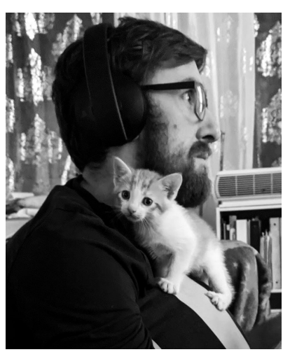
"I have a shoulder to lean on."