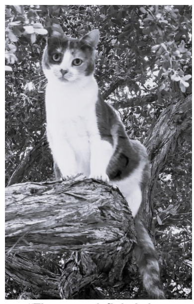
"These are definitely better working conditions."

Who says animals aren't self-aware beings with hopes and dreams and plans of their own? Rainbow has been on her journey of self-discovery for a while, ever since "something happened" and she found herself alone and lost in a flooded world near Arroyo Grande. Her first stop was Woods Humane Society... however it seems that things at the shelter did not fit with her goals. She made it clear that she was not content and did not fit in well with the conformity of shelter life. Nor did she envision a life as a house pet... too con-